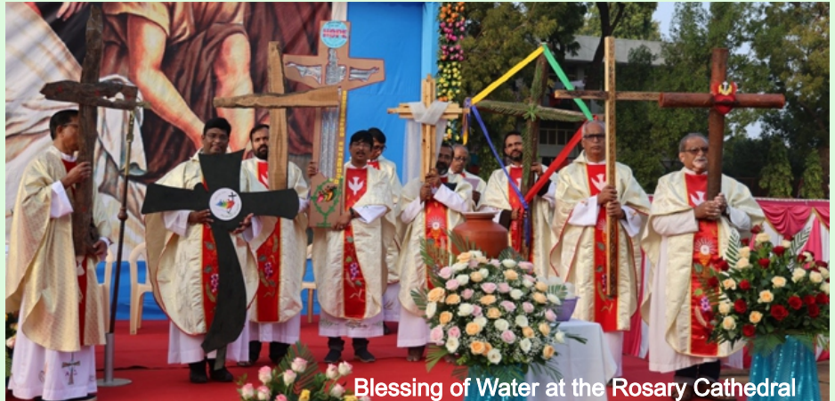
Blessing of Water at the Rosary Cathedral

It was too much of a coincidence for me to read that Mary, "treasured all these things in her heart" (Lk 2:51) on December 29, 2024 as we inaugurated the Holy year and then "pondered them in her heart" (Lk 2:19) just three days later on January 1, 2025. Somehow, the more I think of the Jubilee Year, the more I think of these two phrases that imply listening, discerning, being humbly receptive .