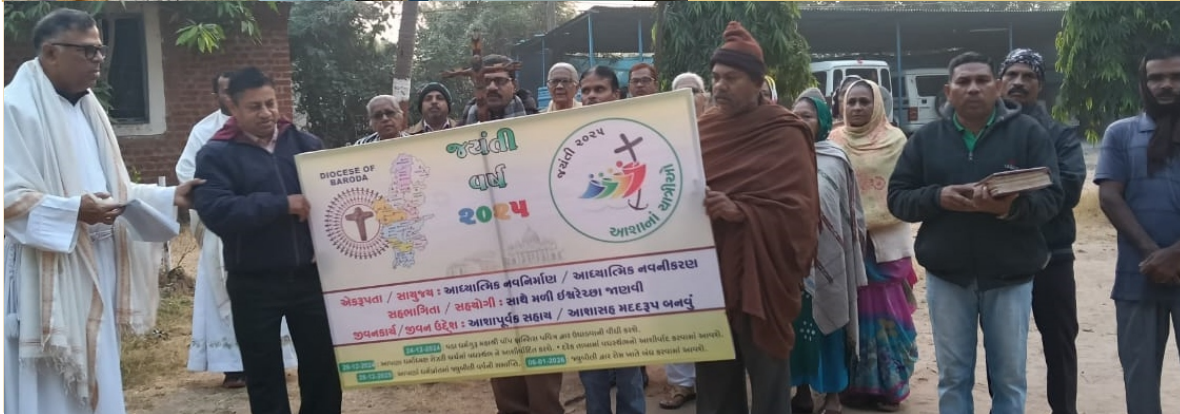
JUBILEE YEAR OPENING IN CHOTE UDAIPUR