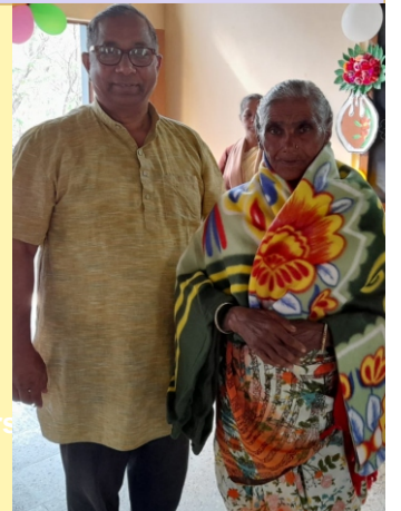
CHRISTMAS FOR THE WISE IN UNAI