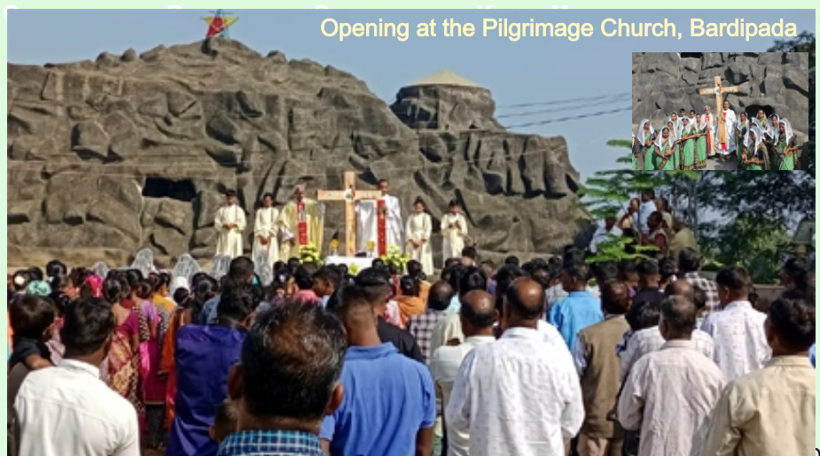
Opening at the Pilgrimage Church, Bardipada

COMMUNION - I understand communion as the constant awareness of presence of the indwelling God at every moment of our lives. It is our basic sacramental spirituality. At Baptism we believe that we are possessed by the