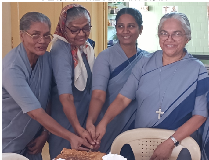
VISIT OF THE SVD GENERAL COUNCILLOR FEAST OF THE RMIS IN AKOTA