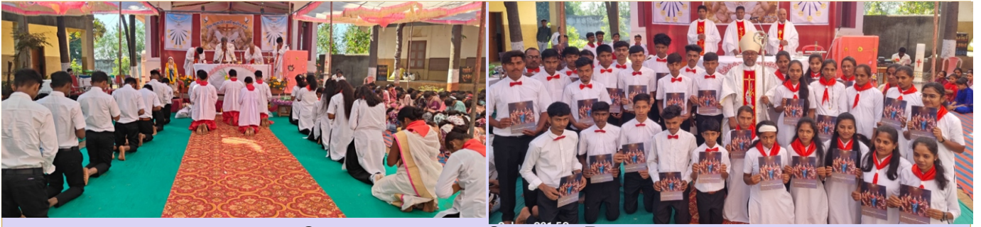
CONFIRMATIONS IN SAGBARA PARISH