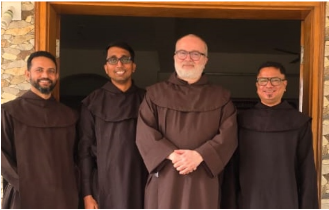
THE DEFINITOR GENERAL OF THE OCD FATHERS VISITS THE COMMUNITY IN BARODA