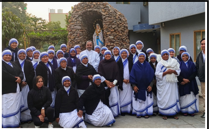
THE REGIONAL HOUSE OF THE MC OF THE MC SISTERS IN BARODA HAS A SERIES OF ONGOING FORMATION PROGRAMS FOR THE REGION.