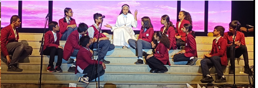
Lourdes Convent CBSE put up a stunning and classy display on its 2nd Annual Day. Started only two years ago, the play on AI and Humans was way above the standard of any school. Congratulations!