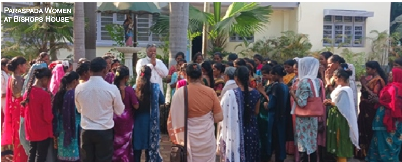
PARASPADA WOMEN AT BISHOPS HOUSE