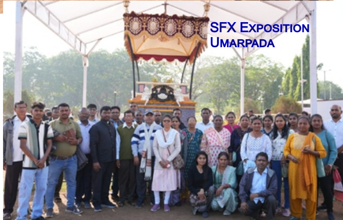
SFX EXPOSITION UMARPADA