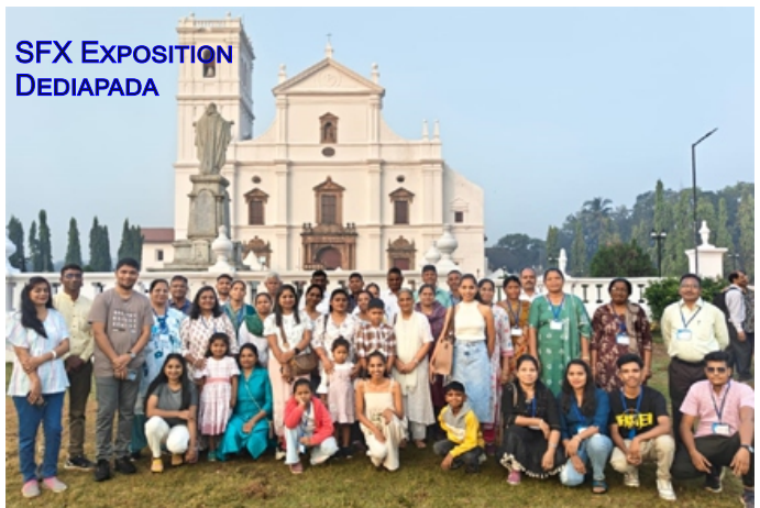
SFX EXPOSITION DEDIAPADA