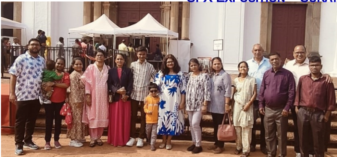
SFX EXPOSITION – SURAT