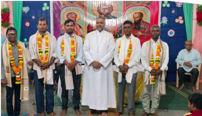
Catechists of Fulwadi and Paraspada