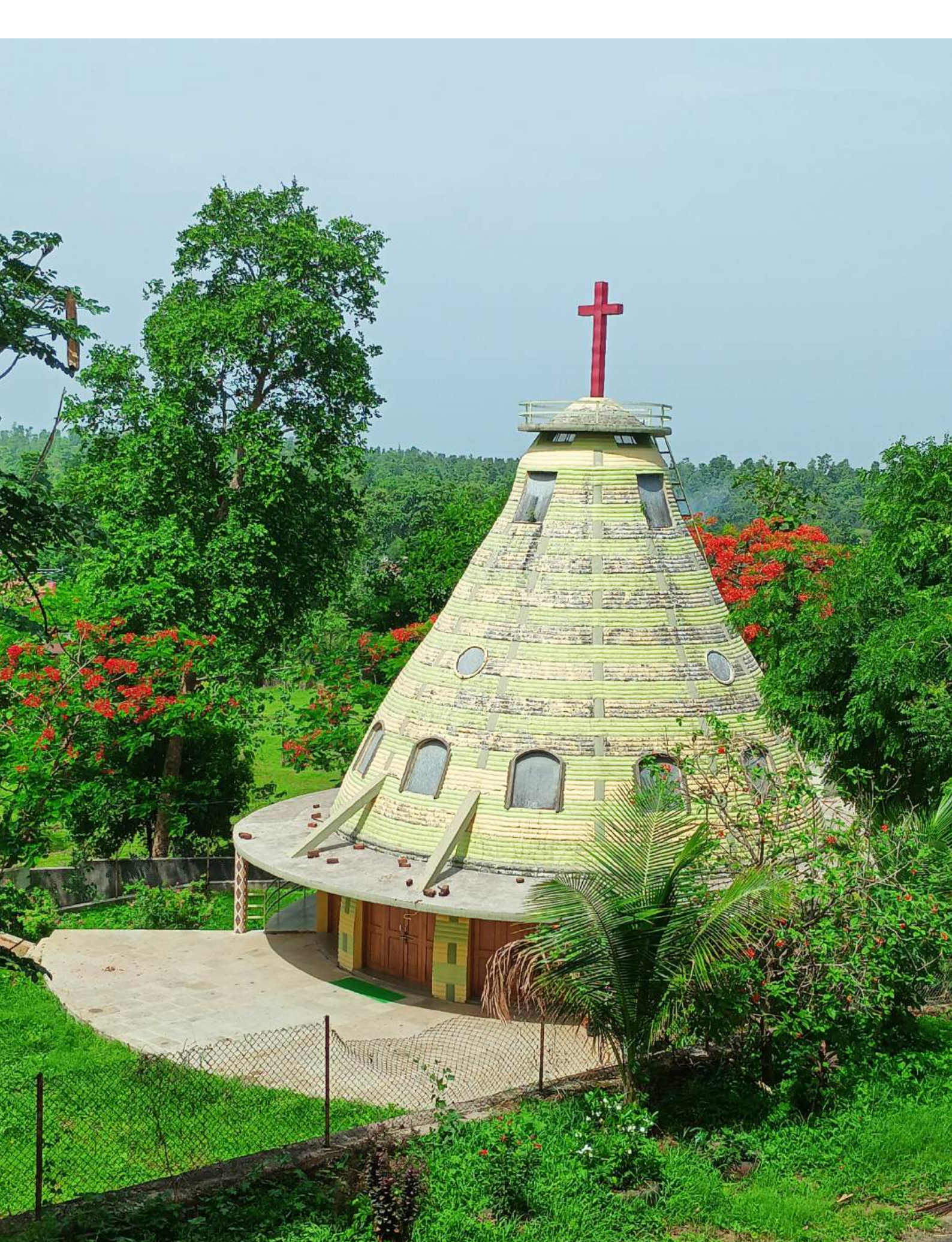
ST PAUL CHURCH, SUBIR SANS MOTS, NO WORDS NEEDED