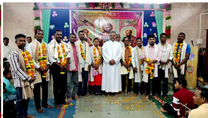
Agewans of Fulwadi and Paraspada