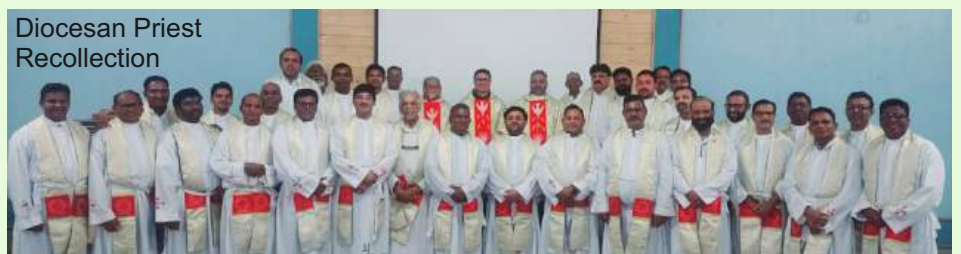
Diocesan Priest Recollection

The concrete modern manifestations of the Divine-Human intermingling was this election. No American could be Pope, said the Americans themselves, rather arrogantly, in their sense of entitlement as a Superpower. By the ways of the