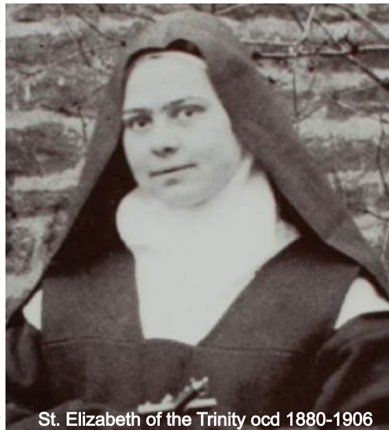
St. Elizabeth of the Trinity ocd 1880-1906

The Holy Spirit's Empowerment: This empowerment was not a one-time event but an on-going process, as they