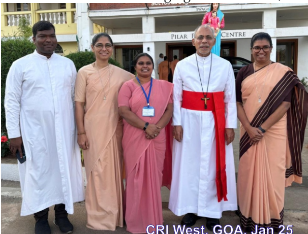
CRI West, GOA, Jan 25

The Pune workshop offered valuable insights into the integration of wellness within religious life and raised greater awareness about the services provided by the St. Dymphna Institute. (patron saint of the mentally challenged). The CRI Western Region also announced its plans for future collaborations with CMHM, aiming to extend wellness programmes to those in formation and congregation members, thereby reinforcing its commitment to the holistic well-being of religious.