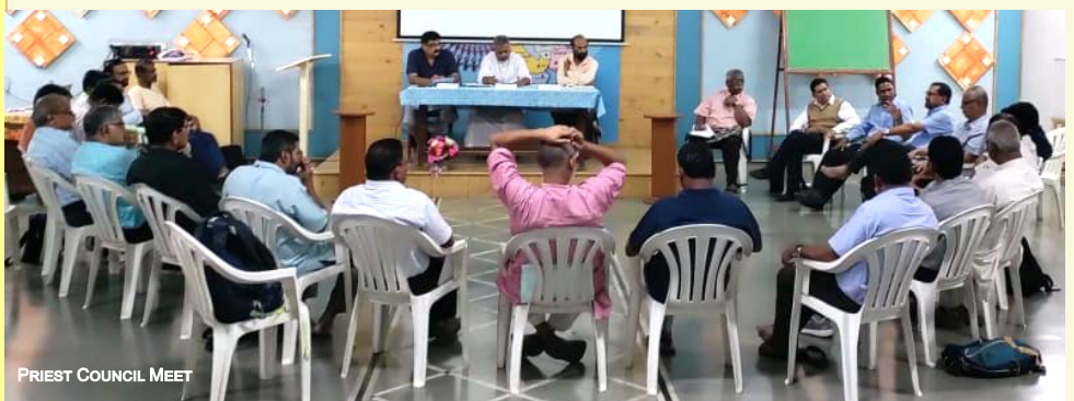
PRIEST COUNCIL MEET

Every issue has two sides or perhaps even eight or more. It is a challenge for us to reflect on in the current Church-World situation, both ad intra and ad extra .