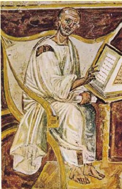
The earliest known depiction of St. Augustine, a 6th-century fresco, Lateran, Rome

SAINT OF THE MONTH ST. AUGUSTINE OF HIPPO AUGUST 28, 2025