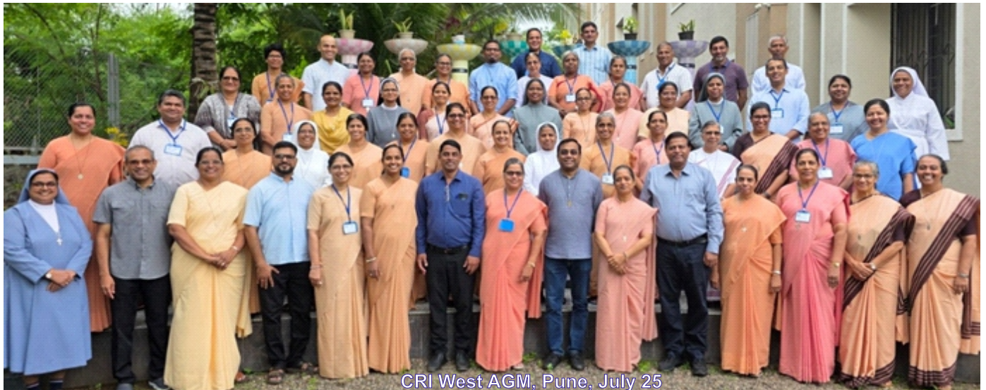
CRI West AGM, Pune, July 25